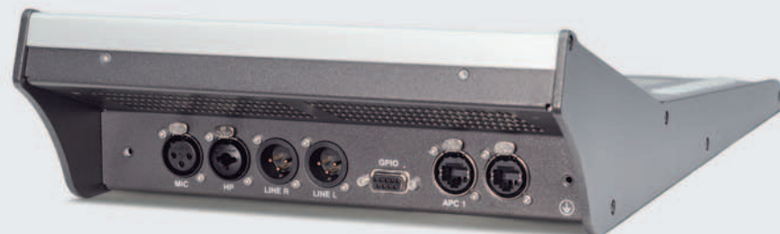
rear view of RX2 Central Module - 52-5810

Two different RX2 modules are available: a central module (52-5810) and a fader module (52-5820).