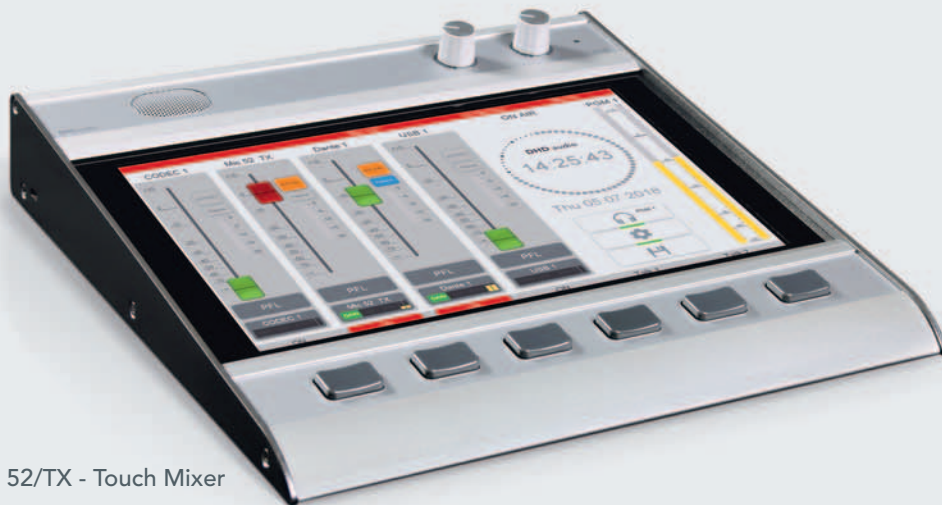
52/TX - Touch Mixer

With the integrated high-quality microphone input and headphone output, the most important connectors are available directly in the device for telephone interviews or dubbing.